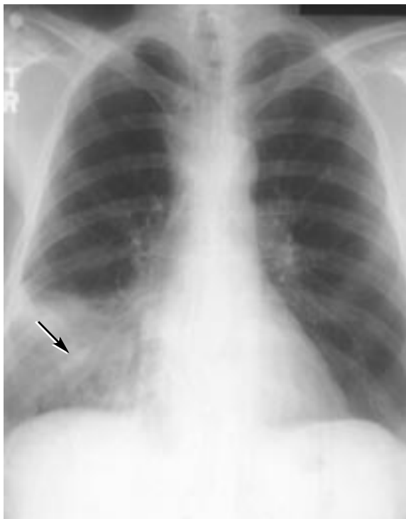
FIGURE 1. Right middle lobe infiltrate (arrow) in a man with systemic lupus erythematosus, fever, pleuritic chest pain, and dyspnea.

His hemoglobin level is 9.2 g/dL and falling