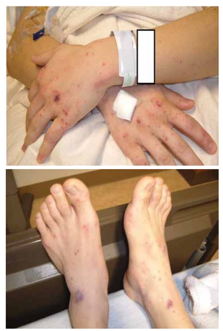
FIGURE 1. Petechial rash from Neisseria meningitides.

A 36-year-old man presents to the emergency department with high fever, headache, and lethargy that developed over the past 24 hours. His temperature is 104°F (40°C), pulse 120 beats/min, respiratory rate 30/min, and blood pressure 130/70 mm Hg. He is ori-